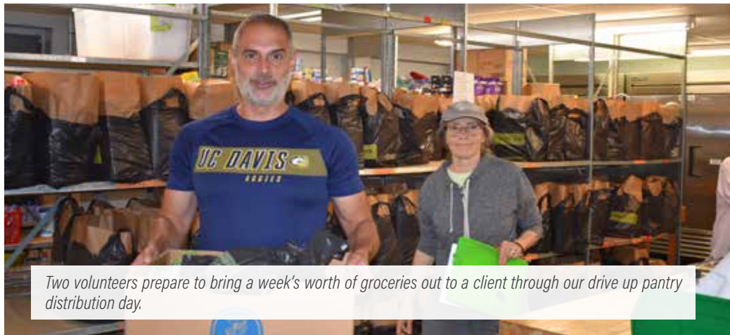
Two volunteers prepare to bring a week's worth of groceries out to a client through our drive up pantry distribution day.

M arlborough residents in need have been served by the Marlborough Community Cupboard since 1992. In 2011 it became a program owned and operated by the United Way of Tri-County.