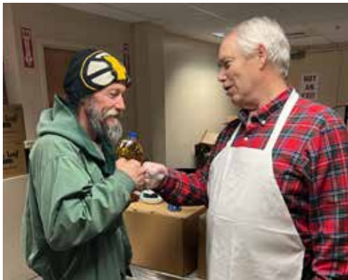
A volunteer at Pearl Street Cupboard & Café puts together fresh dairy items for a visiting family.

The United Way of Tri-County launched its Food Security Initiative in 2011 not only to help people meet their nutritional needs, but also to ensure all individuals are better able to reach their full potential. When families achieve food security, children can concentrate during school, adults perform better at work and seniors maintain independent living. These factors all help people and communities thrive.