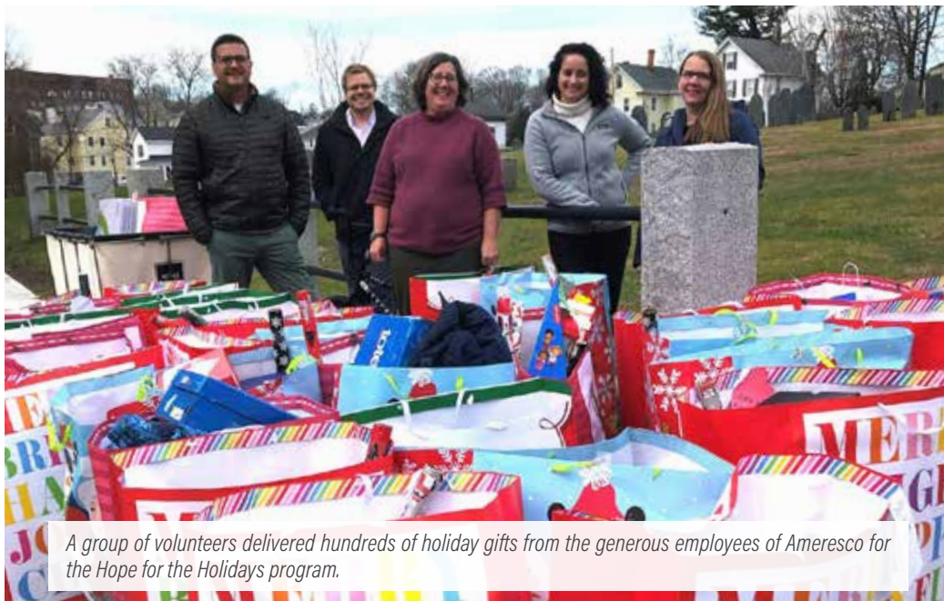
A group of volunteers delivered hundreds of holiday gifts from the generous employees of Ameresco for the Hope for the Holidays program.

Every year the holidays bring tremendous joy and excitement to children and their families. For families that are unable to make ends meet, the holiday season can bring unnecessary stress and worry as they struggle to provide the gifts their children hope to receive.