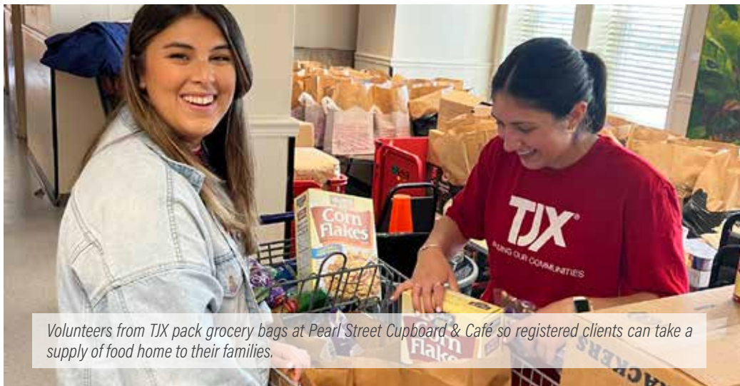
Volunteers from TJX pack grocery bags at Pearl Street Cupboard & Café so registered clients can take a supply of food home to their families.

Since opening our doors in 2012, the Pearl Street Cupboard & Café at Park has become one of the largest food pantries in Massachusetts, serving thousands of local residents who struggle to make ends meet.